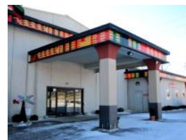
African American Museum of Iowa, Cedar Rapids.

The African American Museum of Iowa [AAMI] located at 55 12th Avenue, SE, Cedar Rapids, is dedicated to preserving and sharing African American heritage and culture in Iowa.